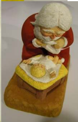
Worshipping Baby Jesus Santa