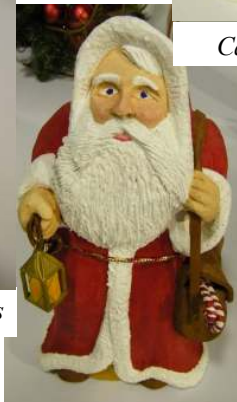
Candy Cane Santa