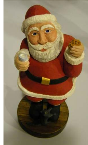
Milk & Cookies Santa