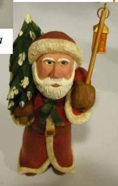
Tree & Lantern Santas