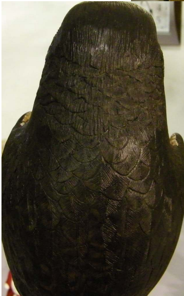
Back of Falcon's neck