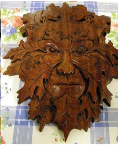
Roy's Forest King